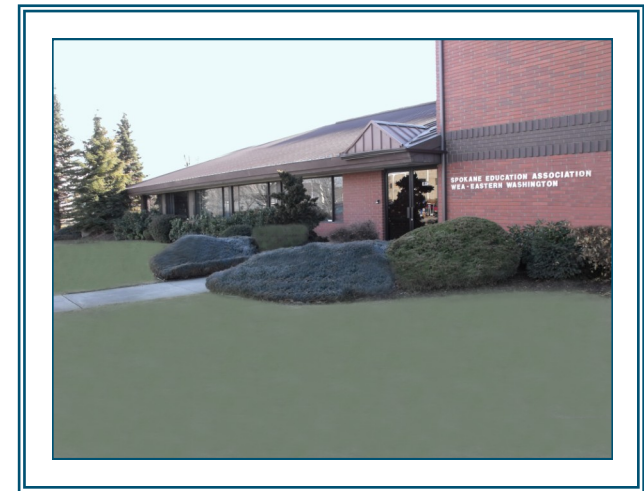
WEA-Eastern Washington UniServ Council

230 E Montgomery Ave Spokane, WA 99207-2272